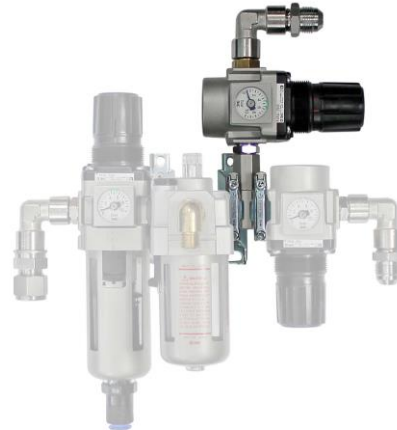
GAS-EXT-ARF-KIT fitted to a 27020-FS