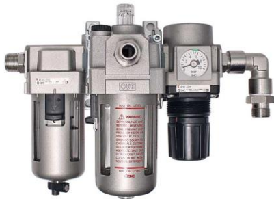
Existing Part number: 21222A Air regulation and filtration unit (ARF)