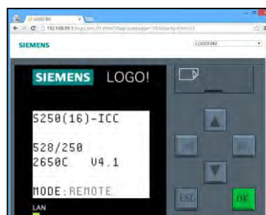
Web browser screen accessed via a laptop

The following data is available on the ARC528E system: