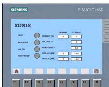
HMI screen specifically designed to monitor values

The screenshots below are examples of screens that can be used to monitor these values: